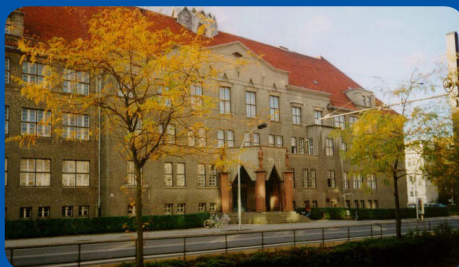
Welcome Center office